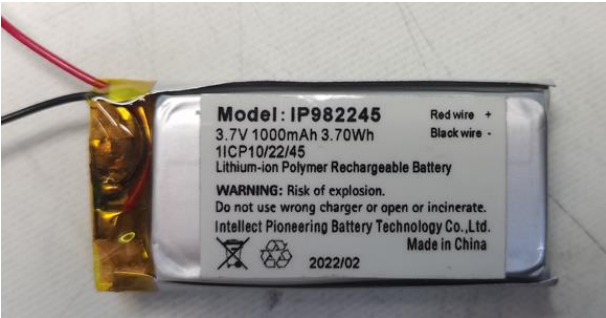
电池/ Battery(IP982245 3,7V 1000mAh 3,70Wh)